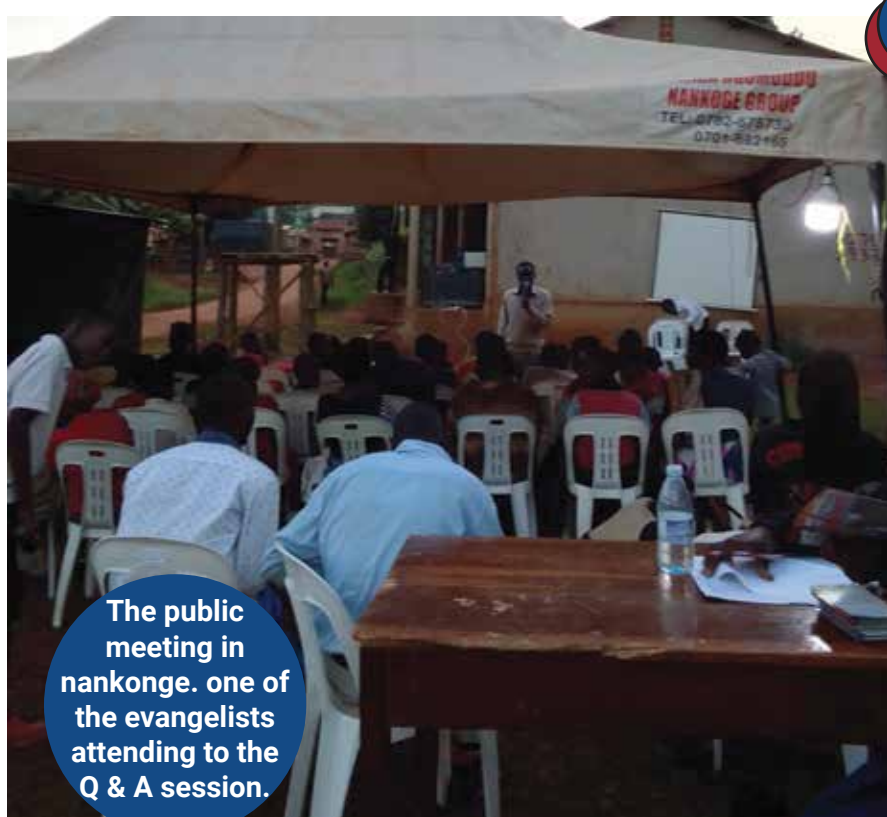
The public meeting in nankonge. one of the evangelists attending to the Q & A session.

The meeting started on 5th july and ended on 3rd august happening every day starting from 7:00pm.