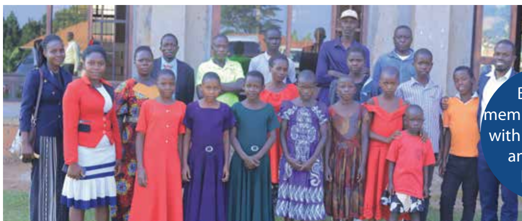
Baptised members pausing with the speaker and church leaders.

We thank God that 16 souls heard the voice of the shepherd through his humble servant and decided to join the one fold.