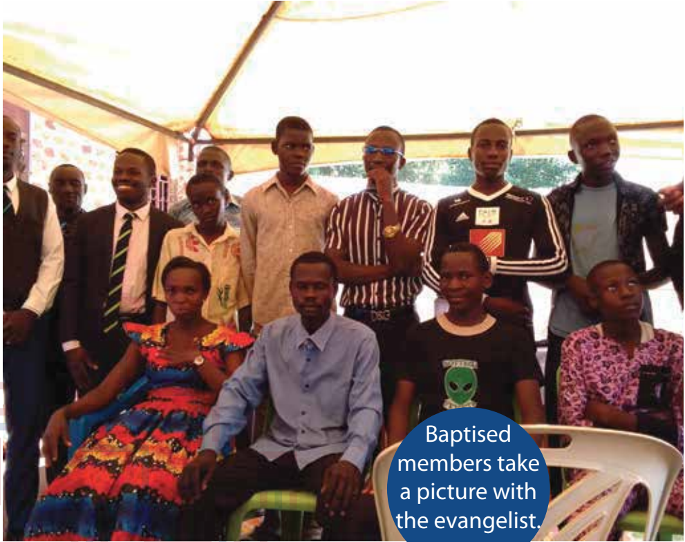
Baptised members take a picture with the evangelist.

We thank God that 9 souls heard the voice of the shepherd through his humble servant and decided to join the one fold.